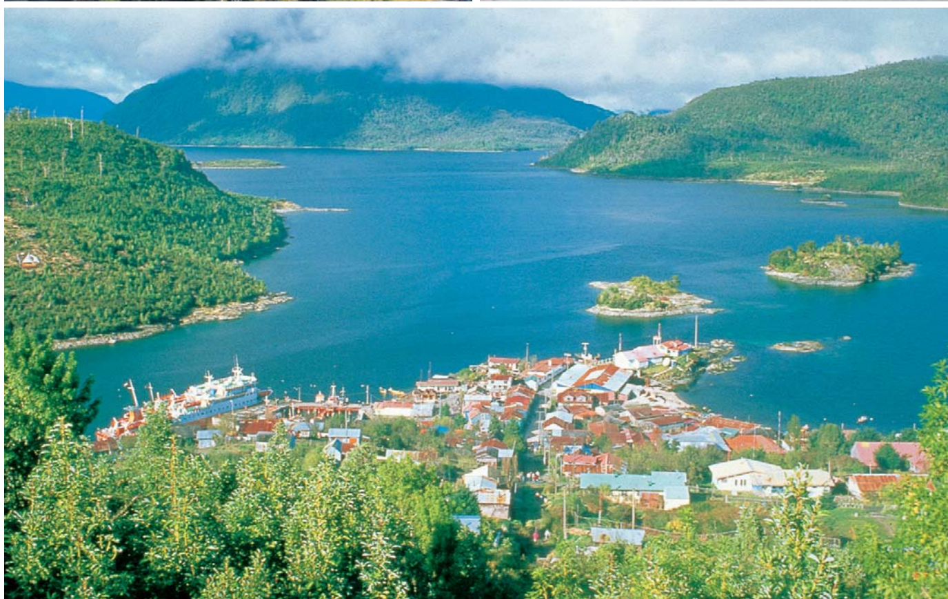
Puerto Montt, Calbuco cities and view of Puerto Aguirre.