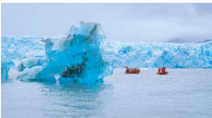
Pío XI Glacier