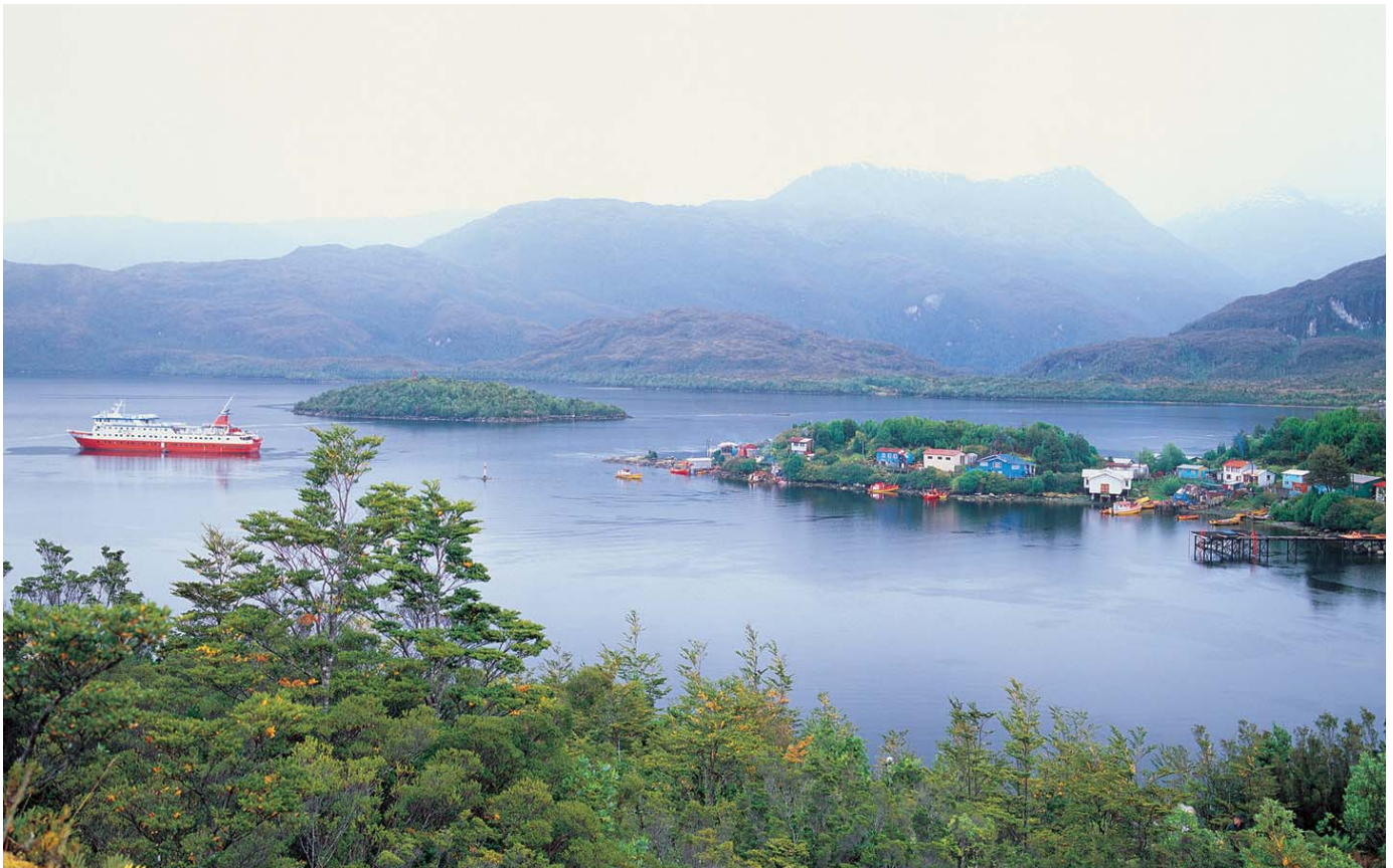
Bernardo Glacier and Puerto Edén.